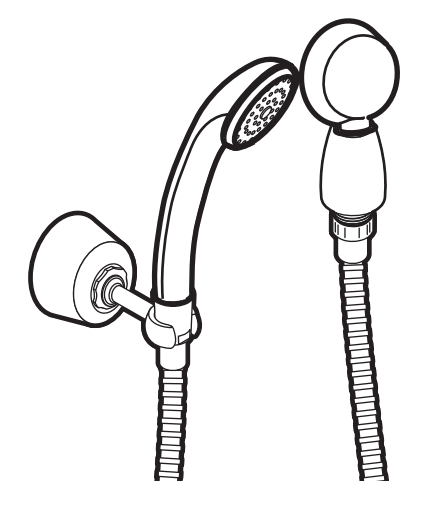
Handshower with Bracket & Hose

• Lifetime limited warranty against material or manufacturing defects