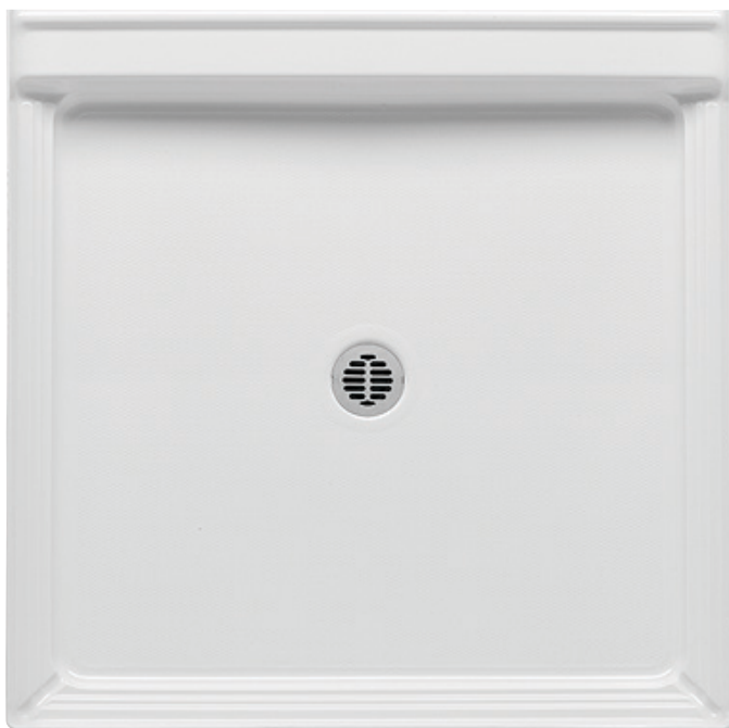
Shown with optional brass drain assembly.