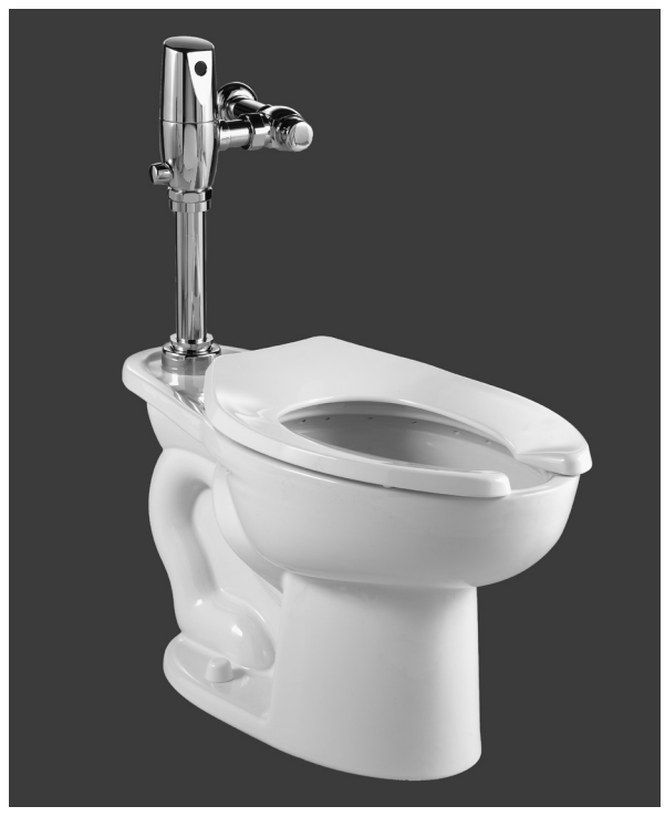
SEE REVERSE FOR ROUGHING-IN DIMENSIONS