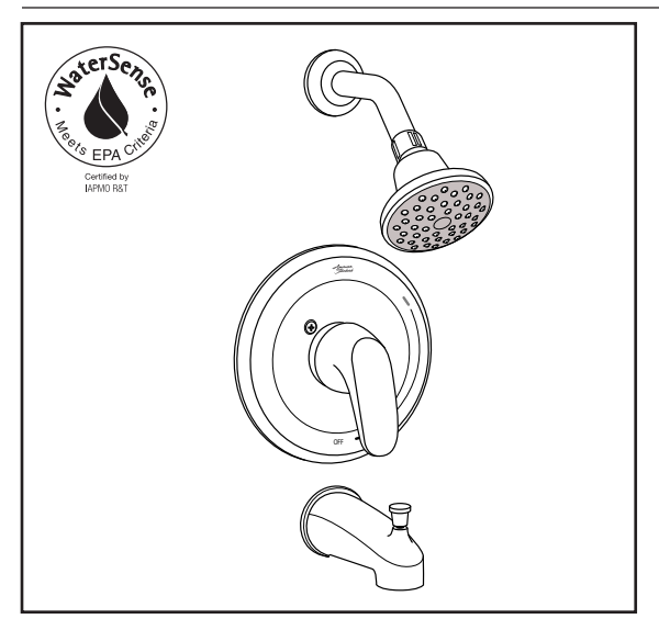
T075.508 Bath/Shower Trim Shown