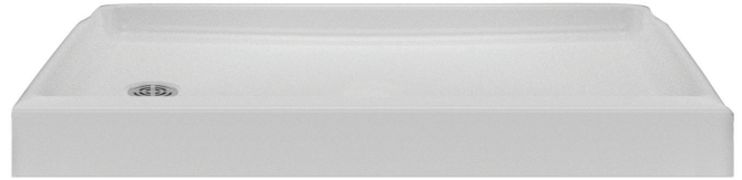
2946.STL shown above