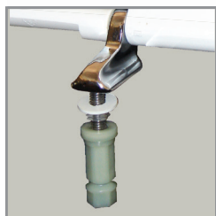
STA-TITE® COMMERCIAL FASTENING SYSTEM™