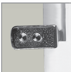
ADJUSTABLE HINGES TO FIT ROUND OR ELONGATED BOWLS