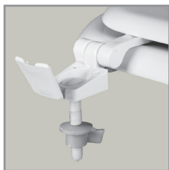
NON-CORROSIVE BOLTS AND WING NUTS