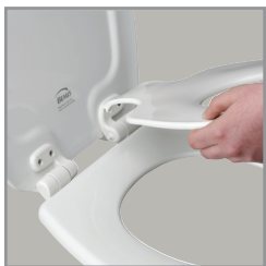
REMOVABLE CHILD SEAT