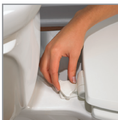
TWIST HINGES TO UNLOCK