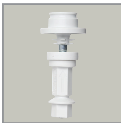
STA-TITE® SEAT FASTENING SYSTEM™