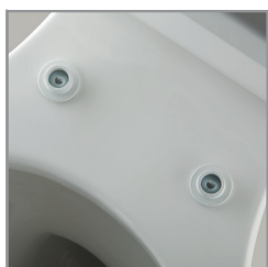
EASY REMOVAL OF SEAT FOR THOROUGH CLEANING