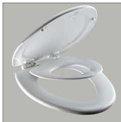
CHILD SEAT SECURES MAGNETICALLY INTO COVER WHEN NOT IN USE