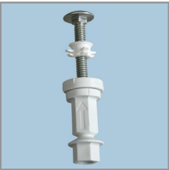
STA-TITE® SEAT FASTENING SYSTEM™