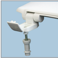
PLASTIC WHISPER•CLOSE® HINGES