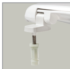
STA-TITE® COMMERCIAL FASTENING SYSTEM™