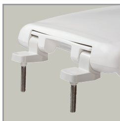
PLASTIC WHISPER•CLOSE® HINGES WITH STAINLESS STEEL POSTS