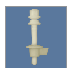
NON-CORROSIVE BOLTS AND WING NUTS