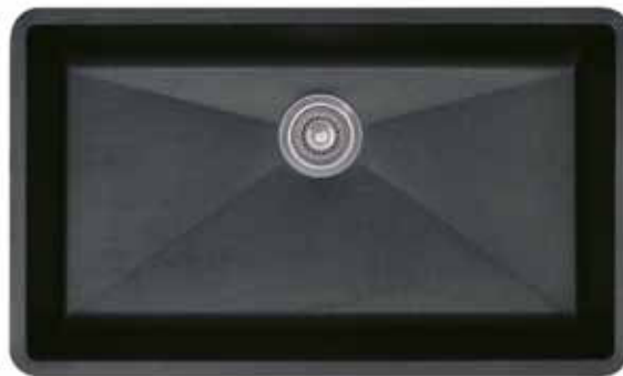
Model 440149 shown