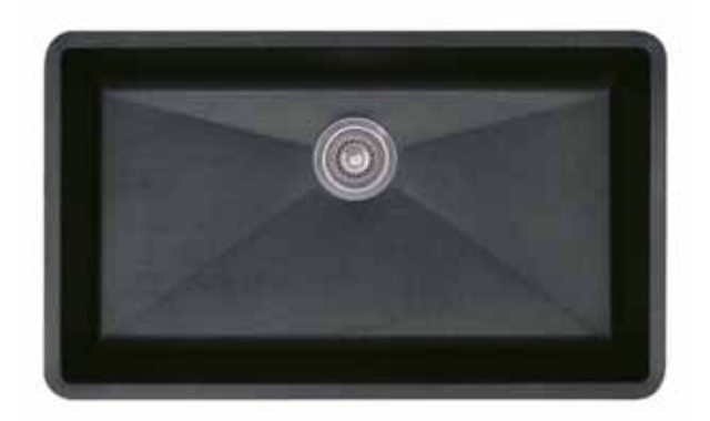
Model 440149 shown