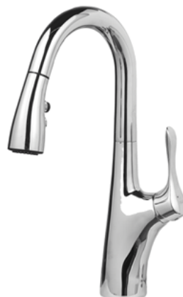
Model 441759 shown