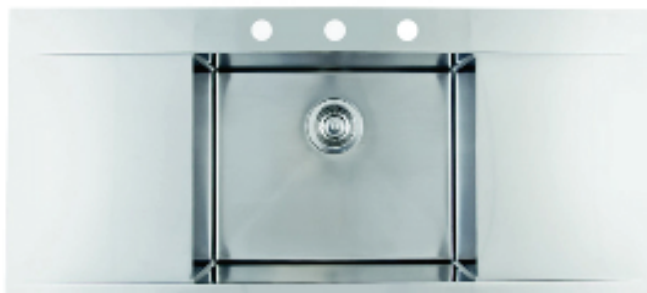
Model 516349 Shown