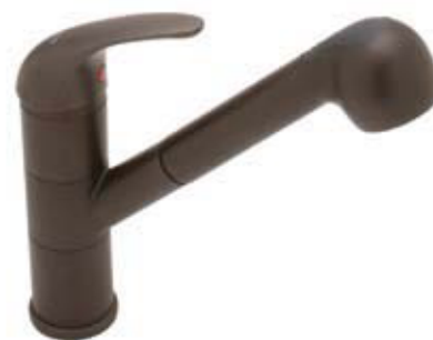
Model 440521 shown