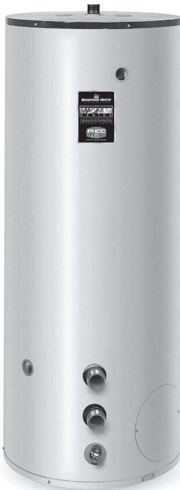
Photo is of M-3-ST80R5