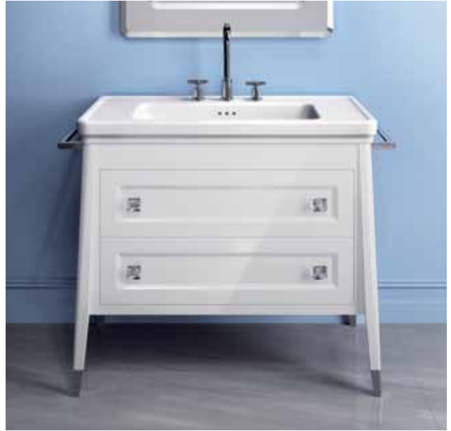
Shown CA0602DR-L01 White Lacquer finish with optional 160CV00 washbasin and 5PLS85RO lateral towel rails.