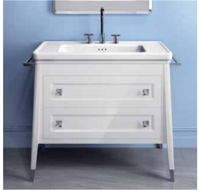
Shown CA0902DR-L01 White Lacquer finish with optional 190CV00 washbasin and 5PLS85RO lateral towel rails.