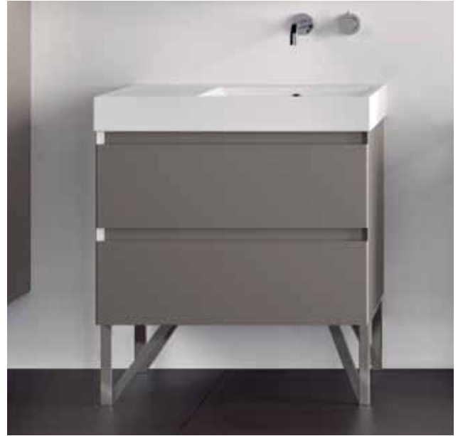
Shown LEGS30MN with satin nickel finish