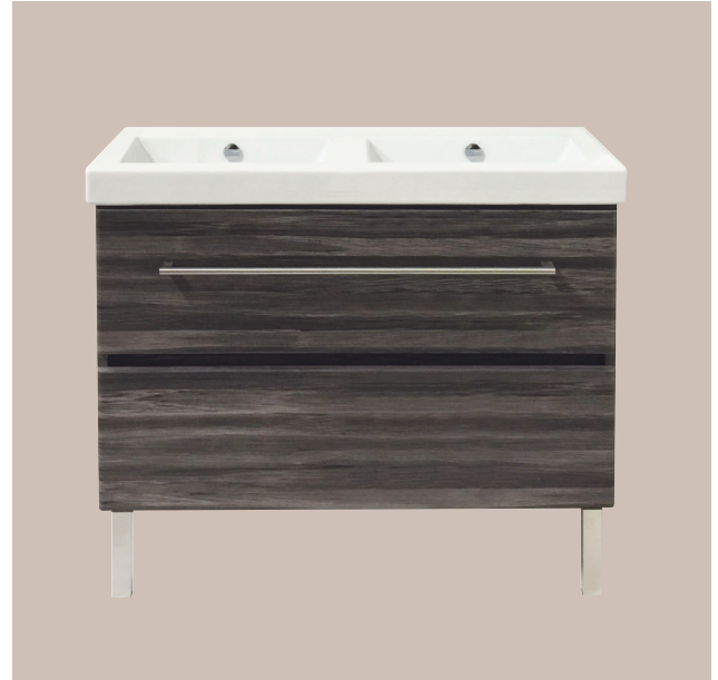
Shown NL1252DR-07 with optional 1125LI00 washbasin