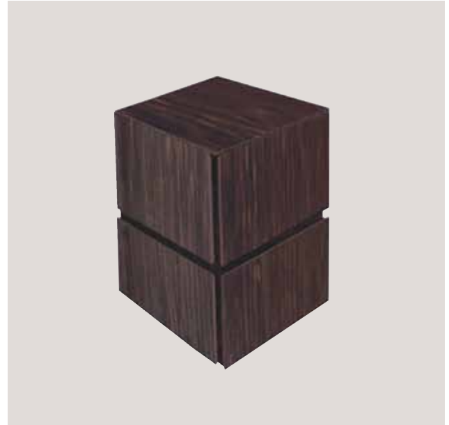
Shown PM04S2DRB-V09 Wood Veneer finish with required Premium Countertop Insert.