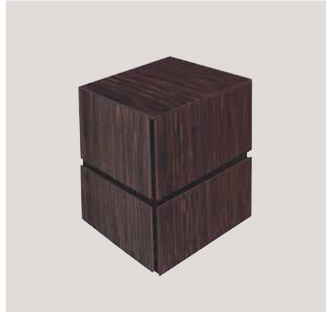
Shown PM05S2DRB-V09 Wood Veneer finish with required Premium Countertop Insert.