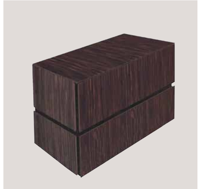
Shown PM10S2DRB-V09 Wood Veneer finish with required Premium Countertop Insert.