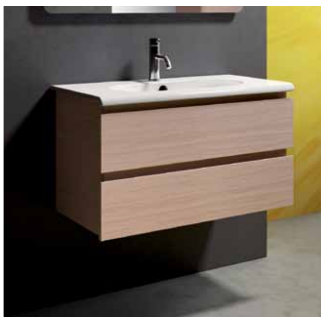
Shown SF1002DR-V08 Wood Veneer finish with optional 110SF00 washbasin