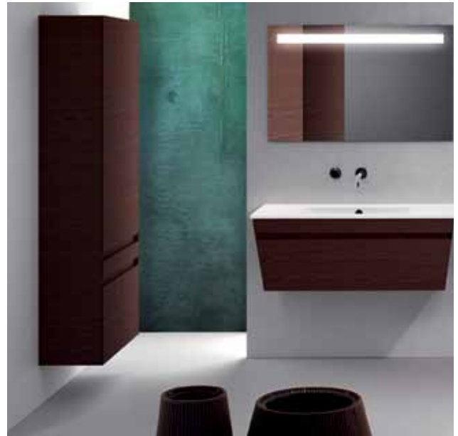
Shown ST0702DO-V09 Wood Veneer finish