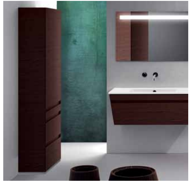
Shown ST0703DO-V09 Wood Veneer finish