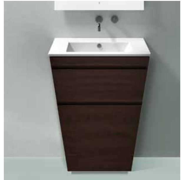
Shown ST0802DR-V09 Wood Veneer finish with optional 180ST00 washbasin