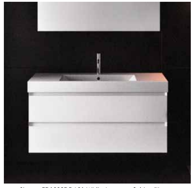
Shown ZD1002DR-L01 White Lacquer finish with optional 110D000 washbasin