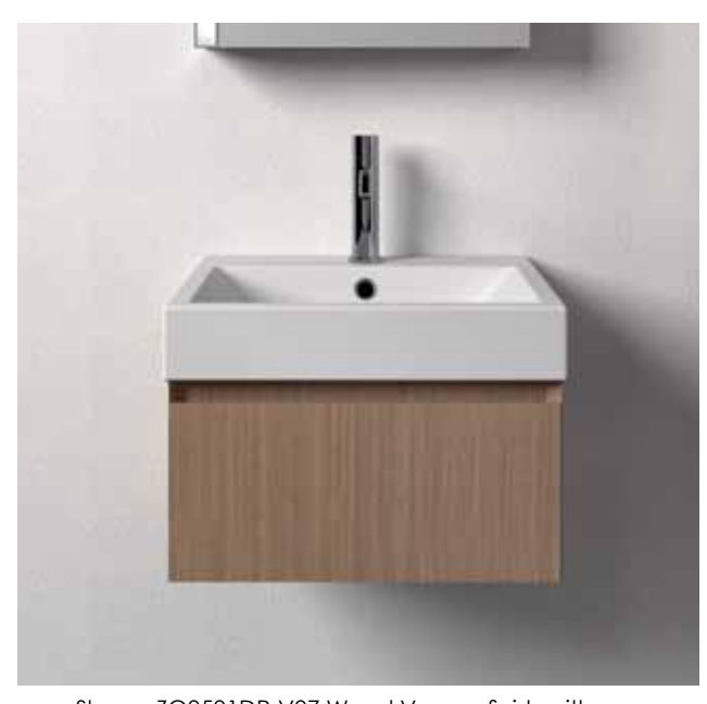
Shown ZO0501DR-V07 Wood Veneer finish with optional 15QZE00 washbasin