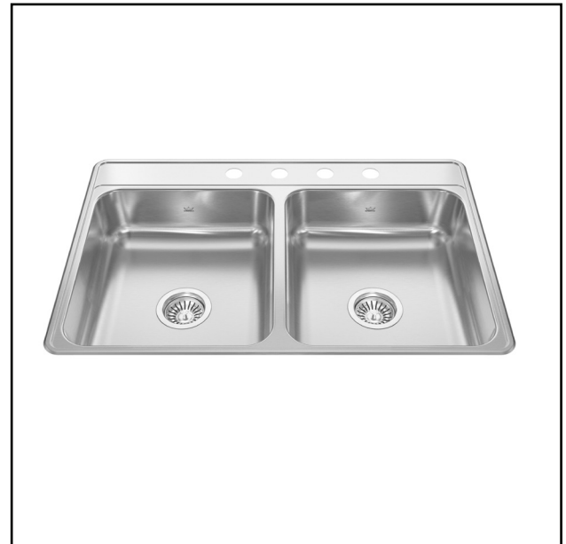
Creemore Topmount/Drop In