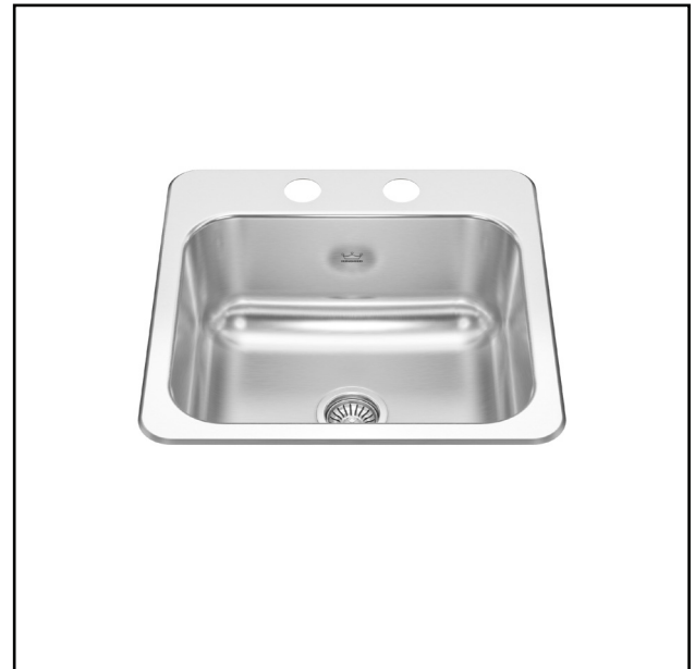
Creemore Topmount/Drop In