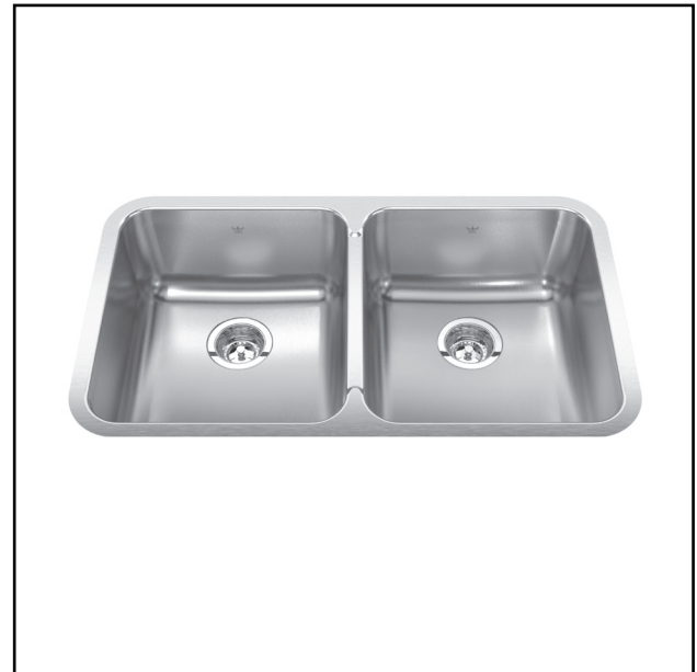
Steel Queen Undermount