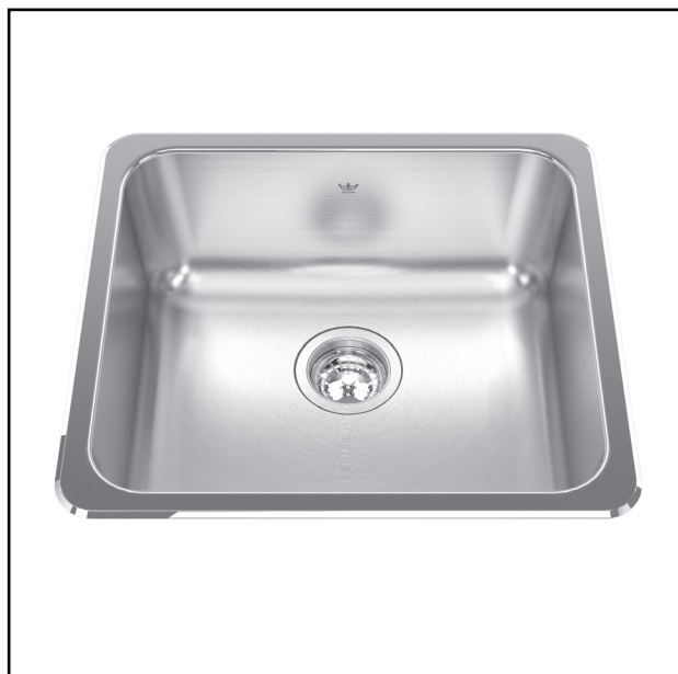
Steel Queen Topmount/Drop In