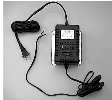
Multi-Unit Power AC Adapter & 24" Wire Lead

Model: 104401 (adapter), 104402 (wire lead)