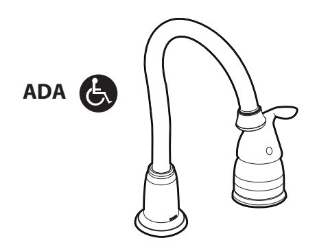
Camerist™ Single Handle Lever Bar Faucet