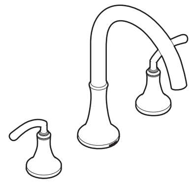
ICON™ Two-Handle Roman Tub Faucet Trim