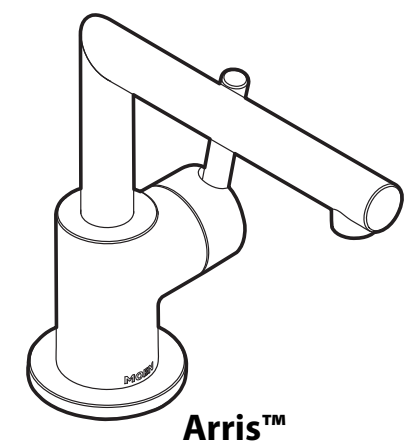
Single-Handle Lavatory Faucet Models: $43001 series

NOTE: THIS FAUCET IS DESIGNED TO BE INSTALLED THROUGH 1 HOLE 1-1/4" (32MM) MIN. DIA.