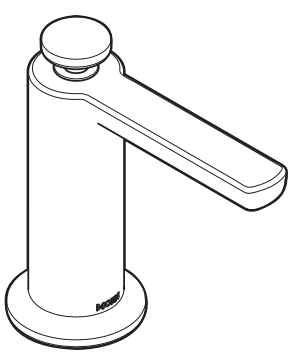
MODERN SOAP/LOTION DISPENSER