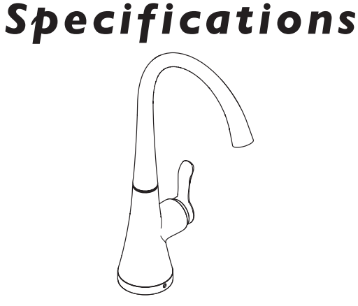
SIP™ Transitional Beverage Faucet