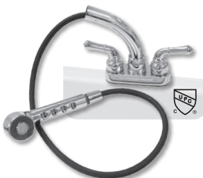
Swivel faucet with 24" long pull-out spout and lever handles