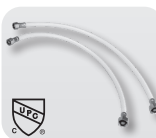
Two flexible, 20" supply lines