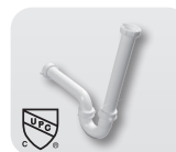
1½" P-Trap with 12" tailpiece