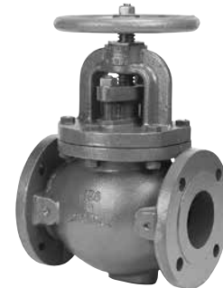
F-738-31 Flanged-Raised Face

2 2" thru 6" have Bronze ASTM B584 Disc. 8" thru 10" have Ductile Iron Disc with Bronze ASTM B584 Disc Face Rings and Brass Pilots.