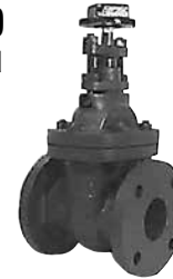
F-619-S0N Flanged With Square Op. Nut