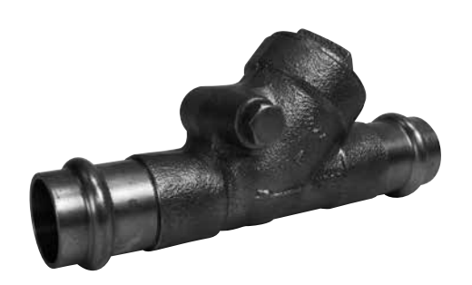
PF413-Y Press x Press Female End