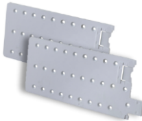
Side Brackets (2)