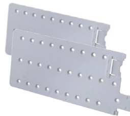
Side Brackets (2)