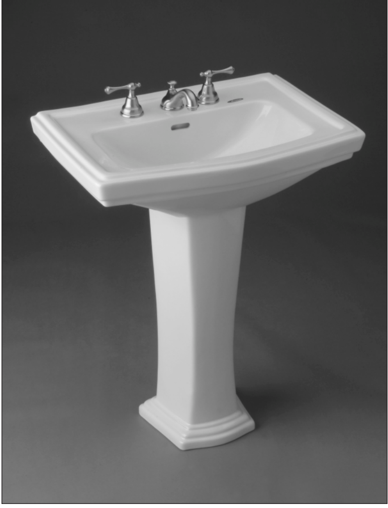
LPT780.8 - Clayton™ Pedestal Lavatory