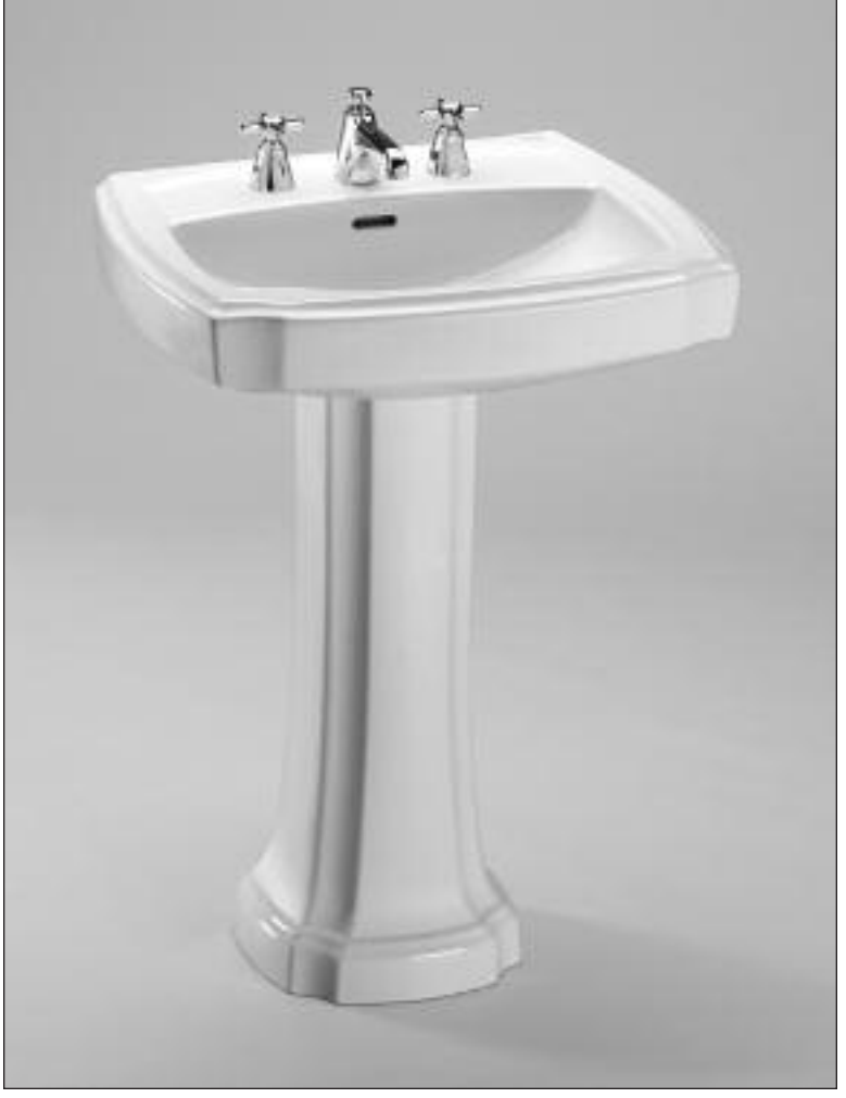
LPT970.8 - Guinevere™ Pedestal Lavatory