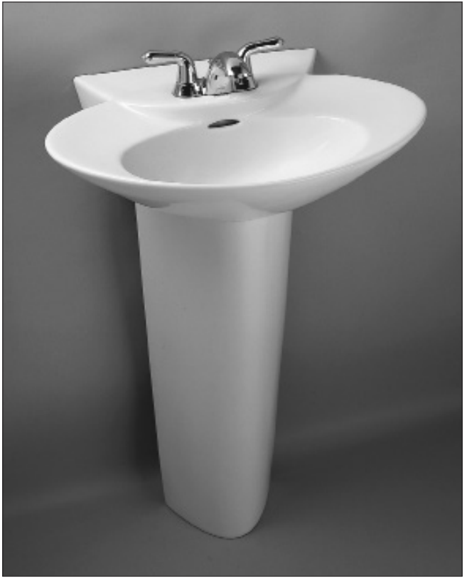
Faucet sold separately