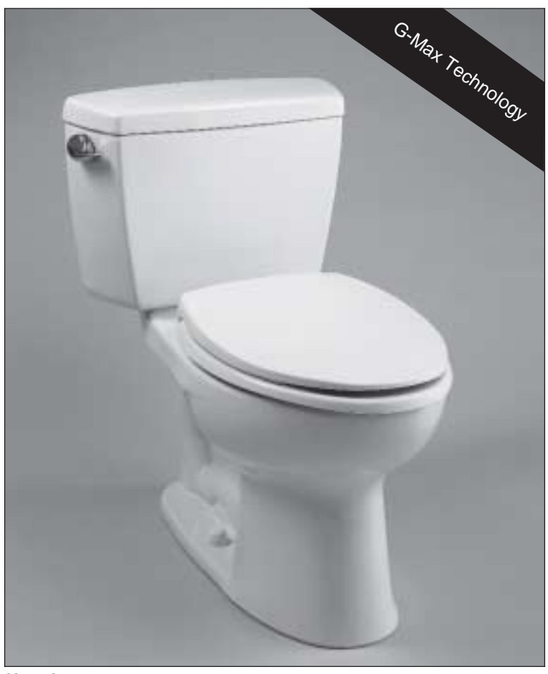
CST744S - Drake Toilet SS114 - SoftClose Seat